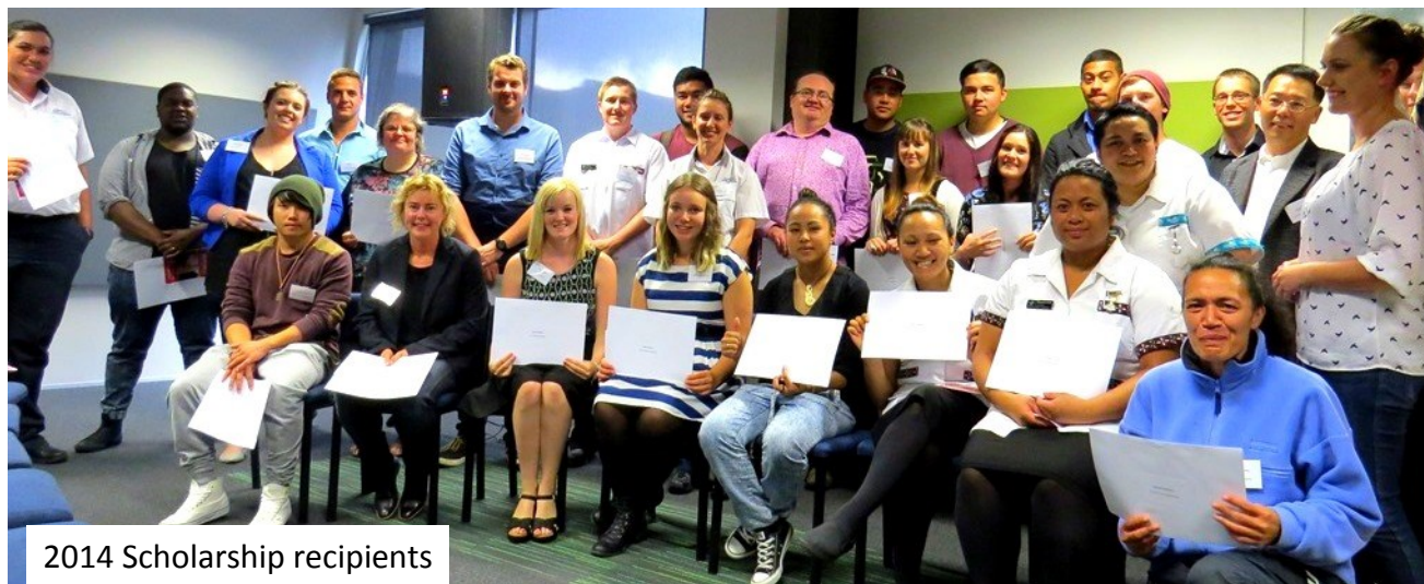
2014 Scholarship recipients